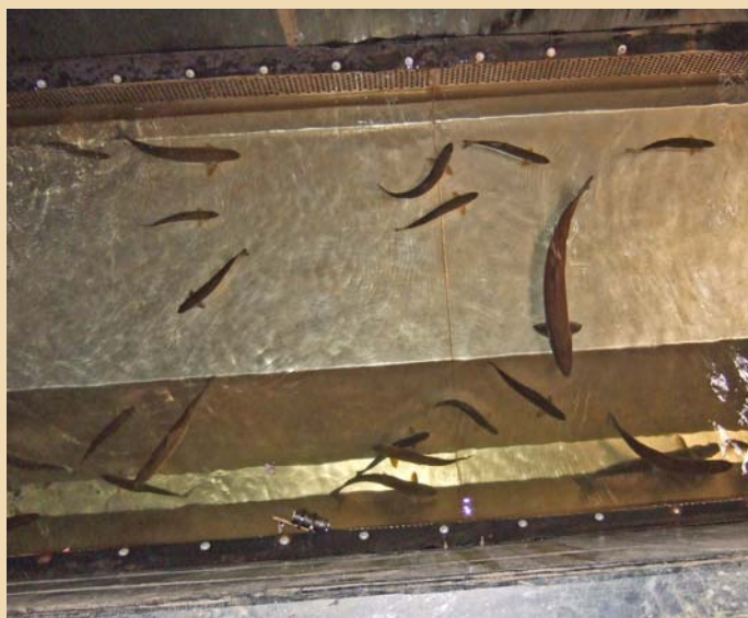
Sea trout and grilse in the trap at Aasleagh Falls

There has been a remarkable recovery in the sea trout stock with fish returning in a very healthy state and most devoid of lice. Early summer brought a very good run of sea trout into the lower beat on every tide – despite the low water in June the sea trout managed to run the fish pass at Aasleagh Falls. The best run during June was 178 trout to 2.5lbs through the fish counter in a day – however this was superseded on the last day of the month when just over 500 sea trout passed through during a small spate. Data on the number of sea trout is included in the table for Aasleagh Falls fish counter.